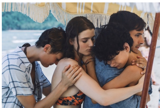
Figure 1. The Family in 'Old' Film (IMDB, 2021)

There are several genres of films that we can enjoy, such as horror, action, science-fiction, and drama. The word 'genre' comes from the French language that represents type, collection, or category (Kamalesh, Lakhota, & Pandey, 2019). Films that we can see these days are categorized into genres based on aspects in the story and we can sense that by viewing the whole part. The 'Old' Film (2021) is considered as a drama because it reflects social issues occurring in our life and involving families (Mukhibova, et. al., 2022).